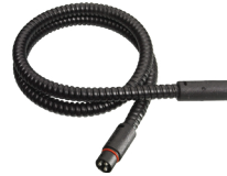
PlugIn extension cable