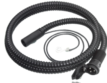
PlugIn inlet cable