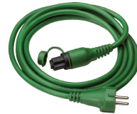
MiniPlug connection cable